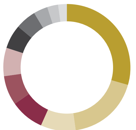
Sector Breakdown of the S&P ASX 300 Index

The Fund provides an ideal exposure for Eligible Investors looking to gain exposure to the resources sector as a component of a balanced investment portfolio.